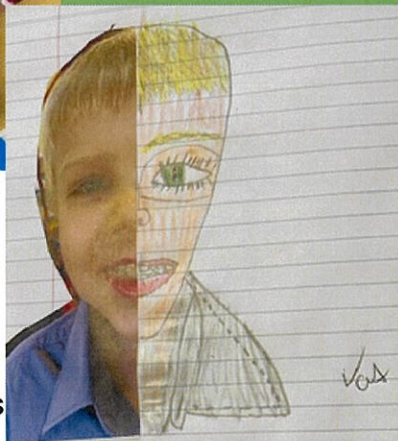
I can divide my face in half. The middle line is a line of symmetry. One side is a reflection of the other.

Teachers are targeting particular knowledge and skills that will enable us to fill the gaps of numeracy using the Numeracy Learning Progressions. This enables us to ensure that students have all the foundational skills to become confident and competent mathematicians throughout school and beyond!